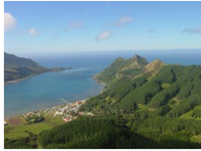
Ha'urei village and harbour entrance (D. Kennett)