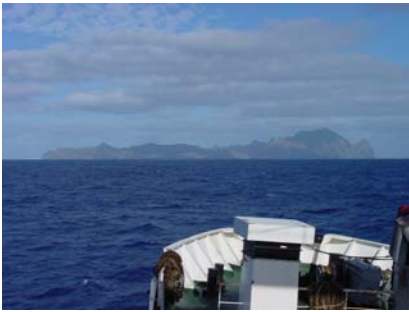
Approaching Rapa on ship Tuhaa Pae II