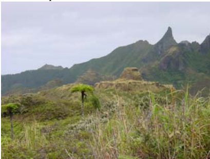
Pare Morongo Uta with Cyathea tree fern in foreground (D. Kennett)