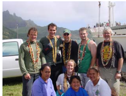
Expedition party and Rapan friends at Ha'urei jetty